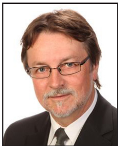
Chair of the Board Hockey Canada 2020-21